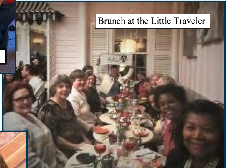
Brunch at the Little Traveler