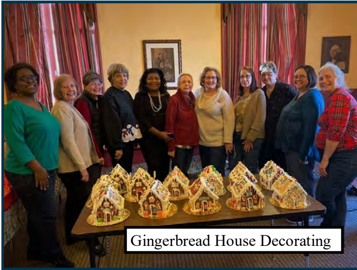
Gingerbread House Decorating