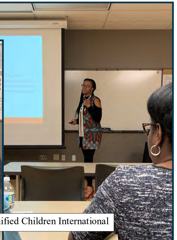
Dignified Children International